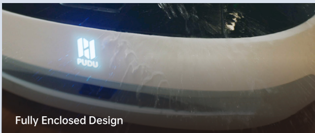
Fully Enclosed Design