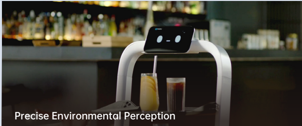
Precise Environmental Perception