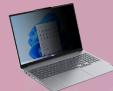
Lenovo 16-inch Premium Clarity Privacy Filter for P16/T16 Gen1 (16:10) 4XJ1U03940