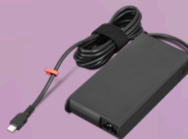
ThinkPad Mobile Workstation 180W USB-C GaN Slim AC Adapter-TW 4X21U28845

Please click here to view the full list of accessories.