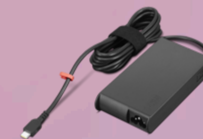
ThinkPad Mobile Workstation 140W USB-C GaN Slim AC Adapter-TW 4X21U28828